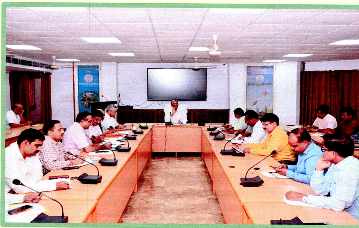
Vice-Chancellor discussing during Senior Officers Committee (SOC) meeting on 07.11.2023