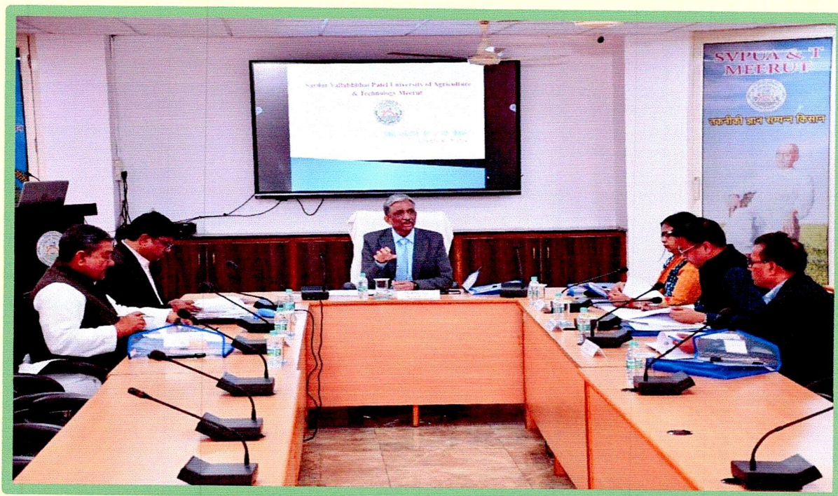
Vice-Chancellor and other members during 19 th Meeting of Finance Committee on 19.02.2024