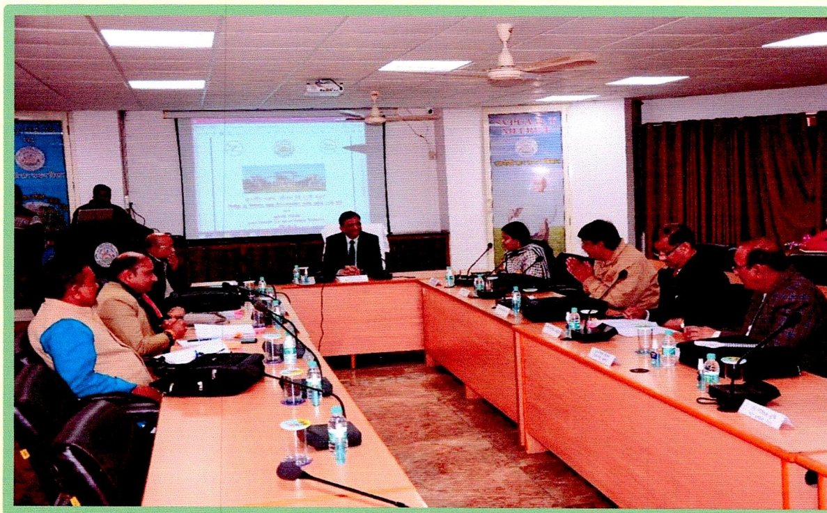
Vice-Chancellor interacting with members of Board of Management during its 51 st Meeting on 06.12.2022