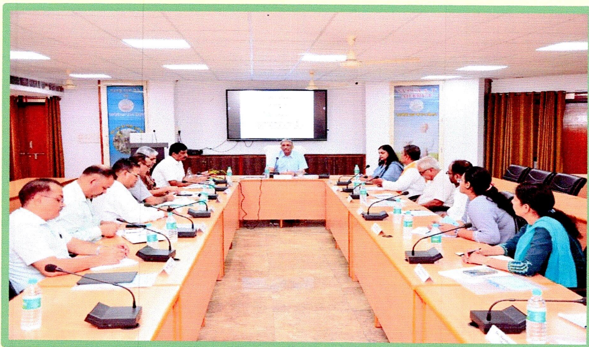
Vice-Chancellor addressing 4 th IQAC meeting on 08.09.2023